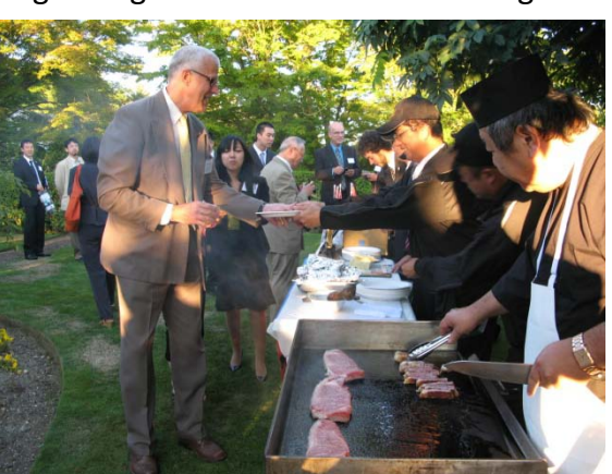
Kobe beef on the grill